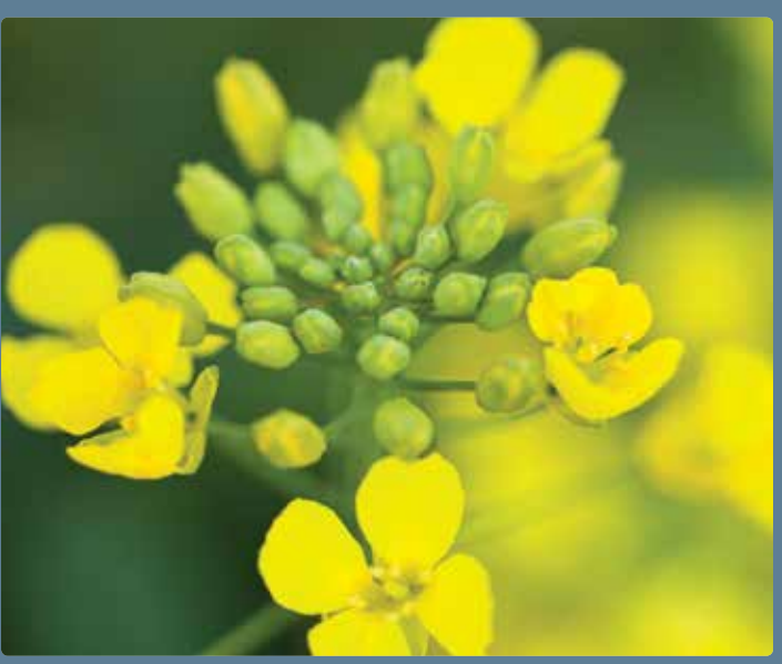
Participant Handbook Risk Management Program